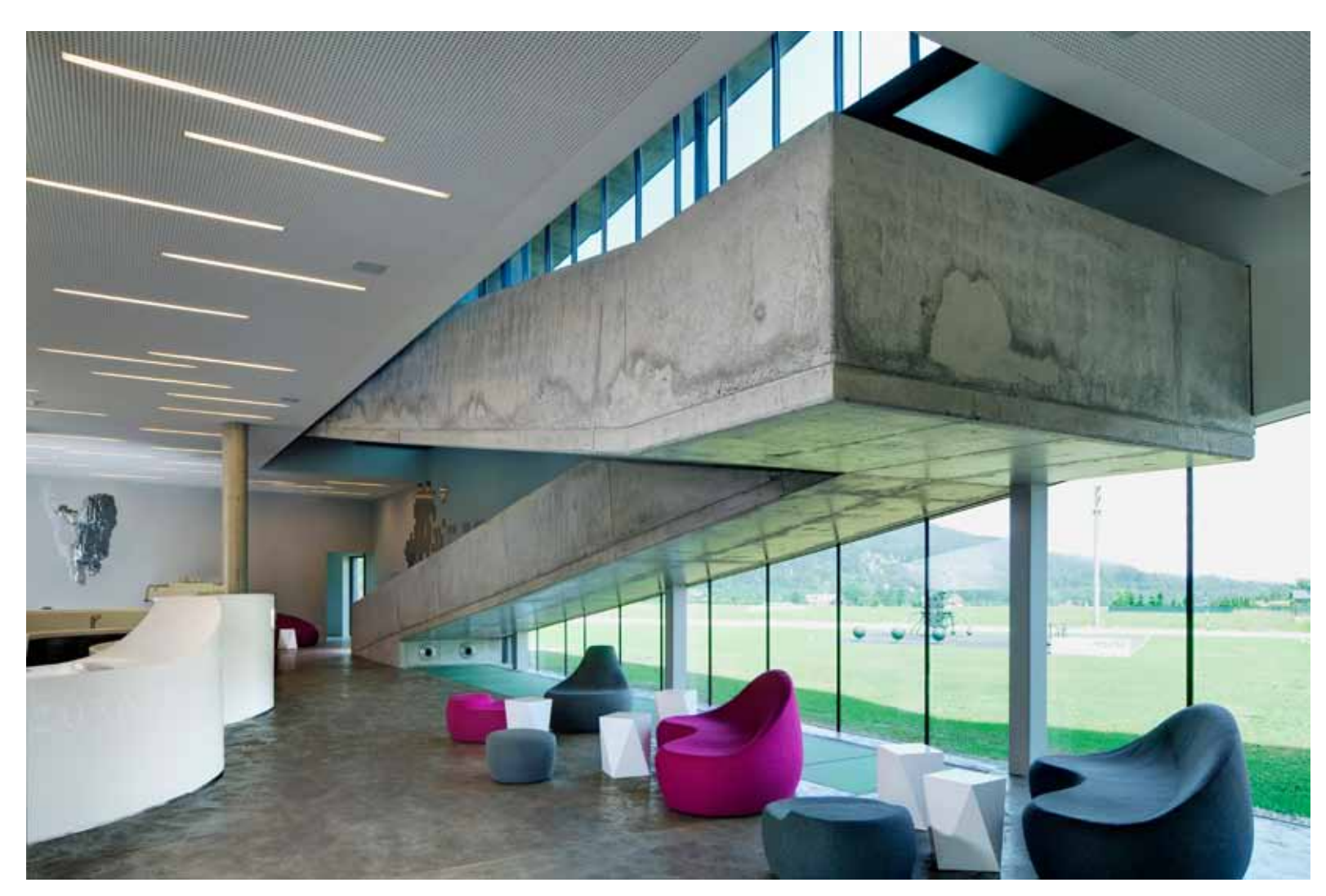
To achieve the books shelves on the floor, the space is lined.