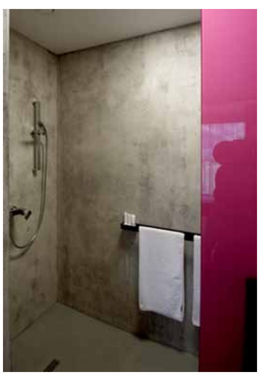
To achieve the books shelves on the floor, the space is lined.